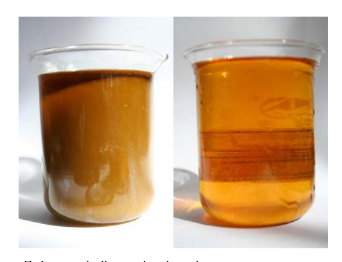
Before and after pretreatment