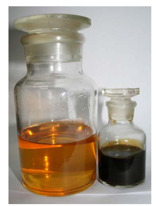
Produced biodiesel from WCO

Problem: The restaurants of shanghai produce 90 tons of waste every day and at present ½ of it is processed into animal food. The main by-product is the waste cooking oil which can be transformed into biodiesel with the appropriate treatment. This product could be sold instead of being disposed.