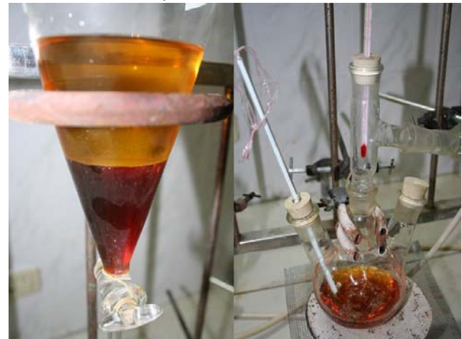
Separation and distillation of biodiesel