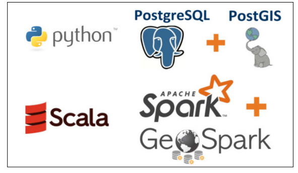
Technology stack of both implementations (first above / second below)