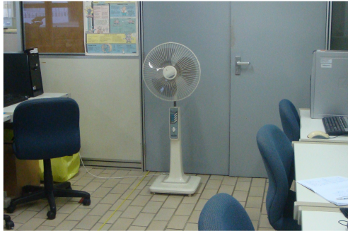
Experimental setup at the Nanyang Technological University with a stand fan during the validation measurement process.