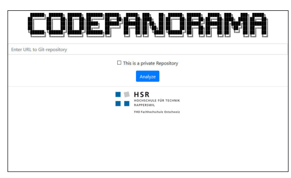
CodePanorama entry page (https://codepanorama.io)